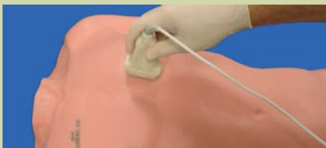
BODY FORM EMBEDDED WITH 258 PROBE LOCATIONS