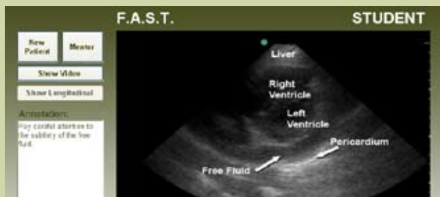
REAL PATIENT IMAGES AND VIDEO