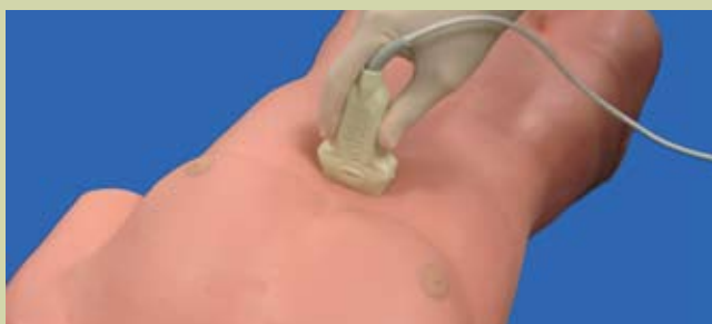
SIMULATED PROBE PLUGS INTO PC